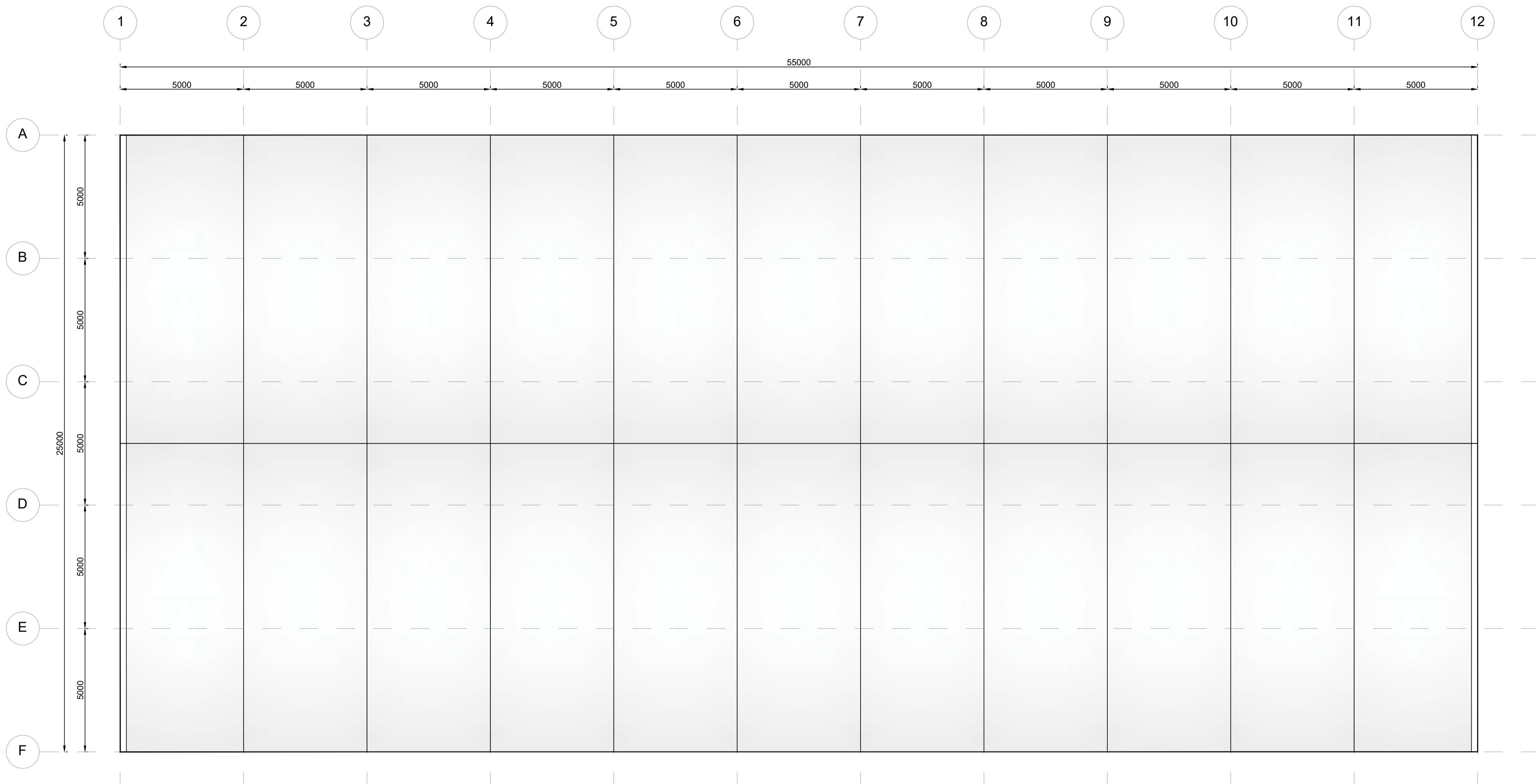
WORKSHOP G (25m x 55m) ROOF LAYOUT SCALE 1:100